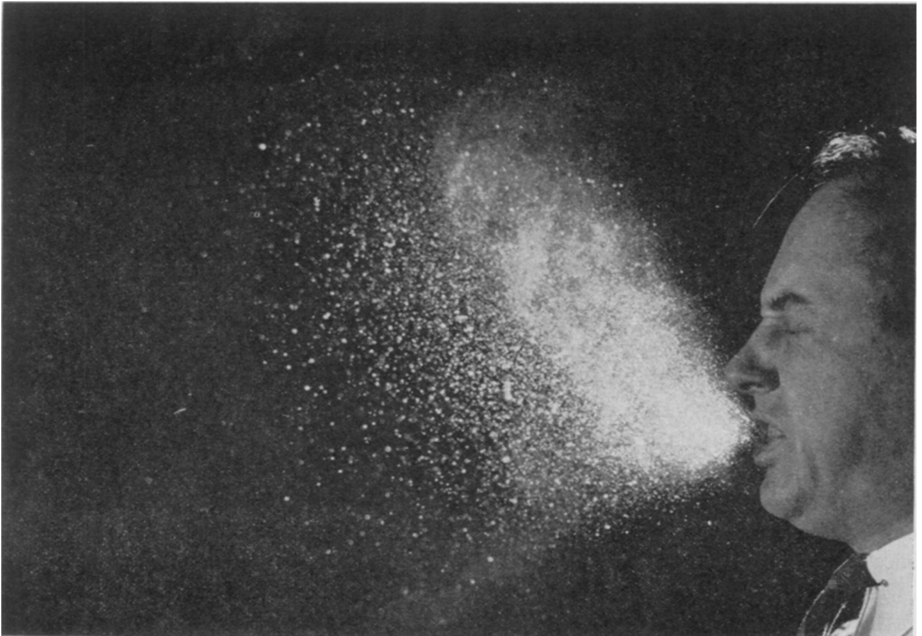
Fig 1 | Short range still imaging of stages of sneezing, revealing the liquid droplets from the 1942 Jennison experiment. 5 Reproduced with permission

Yet eight of the 10 studies in a recent systematic review showed horizontal projection of respiratory droplets beyond 2 m for particles up to 60 \mu\text{m} . 7 In one study, droplet spread was detected over 6-8 m (fig 2). 28 These results suggest that SARS-CoV-2 could spread beyond